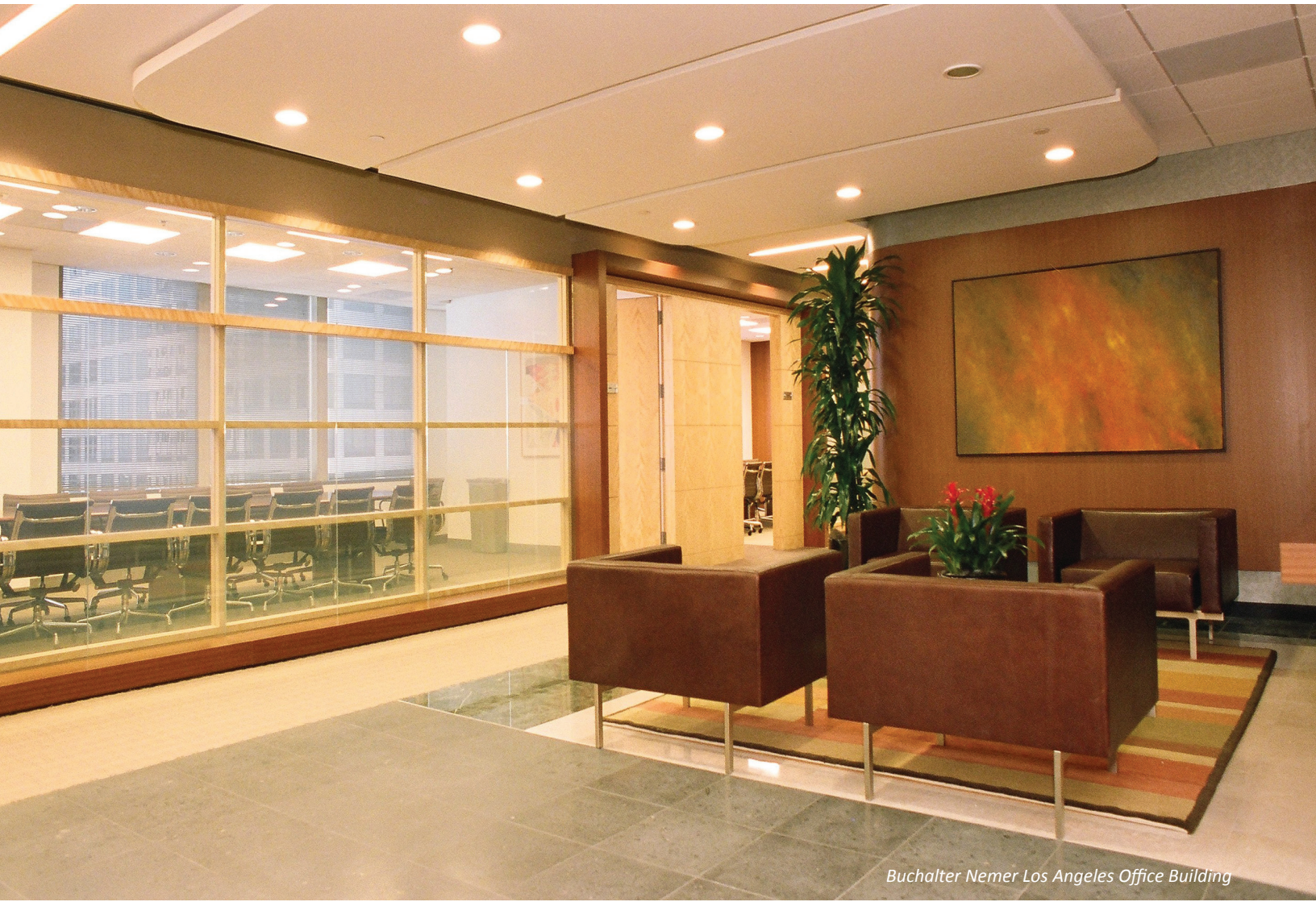
Buchalter Nemer Los Angeles Office Building

Providing expert legal services for six decades